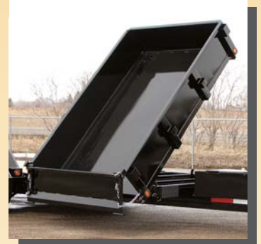
Double acting spreader gate opens from either the top of the dump box (as shown above.) Or opens from the base of the dump box (as shown below.)