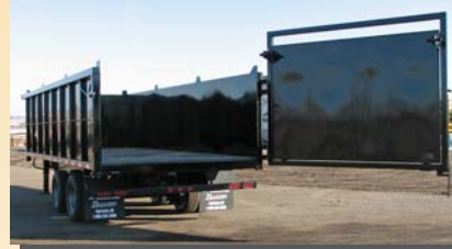
Shown to the left is the Full Swing End Gate.

Shown to the right the scissor hoist is partially extended and the Rear Dump Gate is in use.