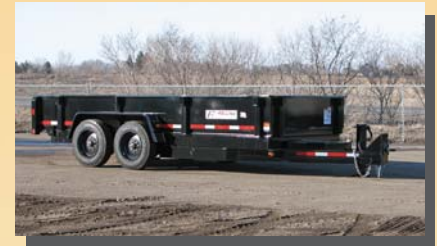
5' slide-out ramps with storage under rear of trailer. Standard double rear swing-out doors shown to the left.