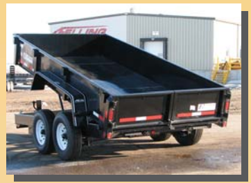
Standard double rear swing-out doors shown above.