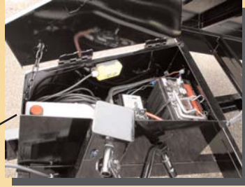
Tool box contains: hydraulic power unit with remote and chargeable battery.