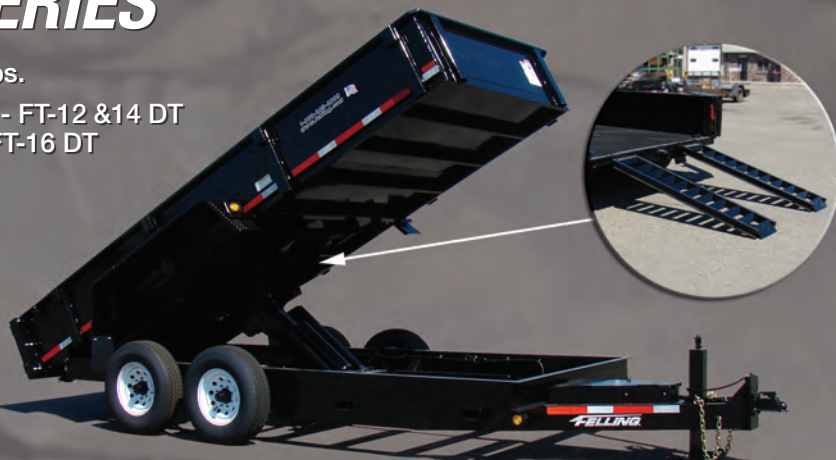
FT-14 DT HD - standard slide-out ramps store under deck