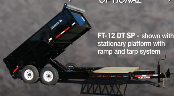
FT-12 DT SP - shown with stationary platform with ramp and tarp system

The Stationary Platform Option can be selected on any of Felling's Hydraulic Dump Model Lines.