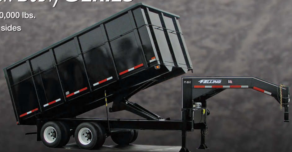
FT-30-2 DT DO Construction Body - shown with optional gooseneck coupler & tie rail around dump box