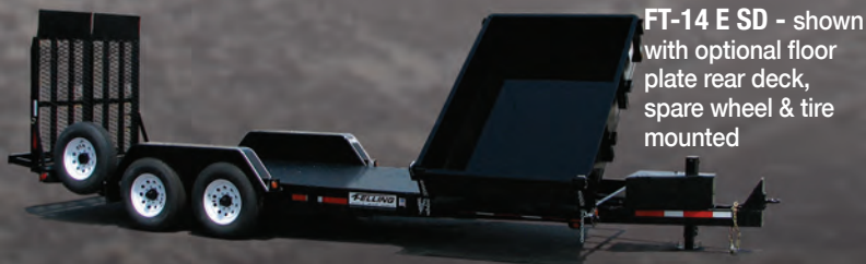
FT-14 E SD - shown with optional floor plate rear deck, spare wheel & tire mounted