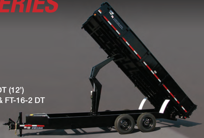
FT-16-2 DT DO