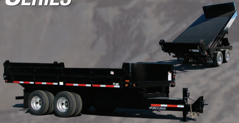
FT-18-2 DT DO Contractor Body standard fold down sides