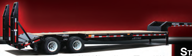
Model Shown Above - FT-70-2 NN-L 56540LAE