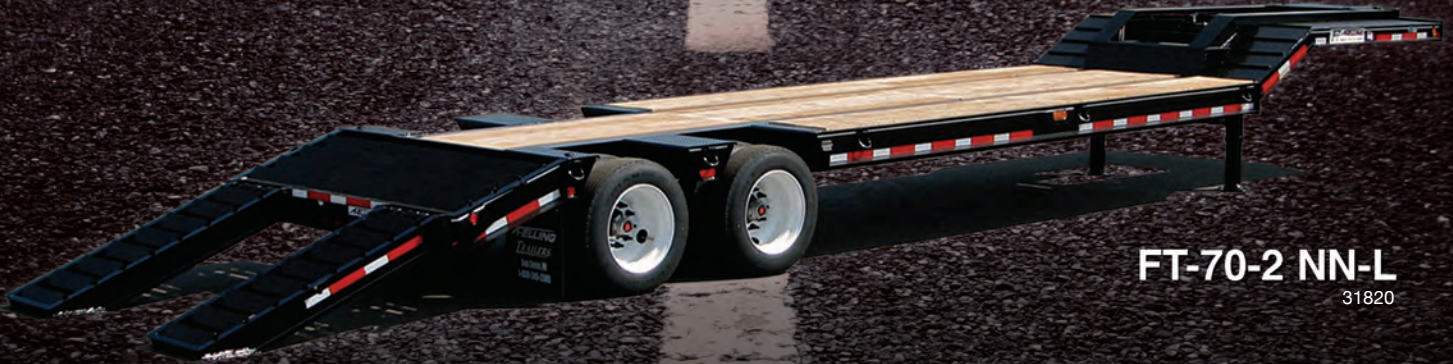
FT-70-2 NN-L 31820