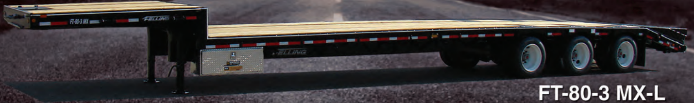
FT-80-3 MX-L 38292