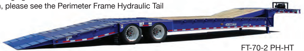
FT-70-2 PH-HT 41266

Payload capacities ranging from 70,000 lbs. to 100,000 lbs. For detailed information, please see the Perimeter Frame Hydraulic Tail brochure HT-102.