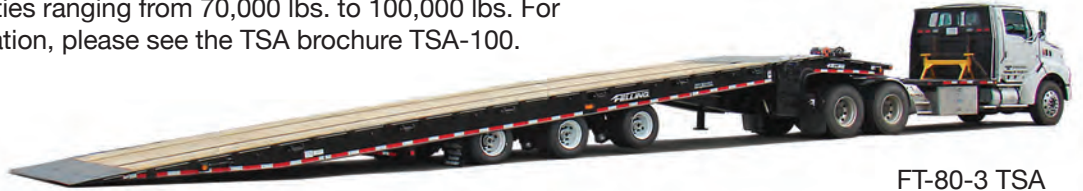
FT-80-3 TSA 41663

Payload capacities ranging from 70,000 lbs. to 100,000 lbs. For detailed information, please see the TSA brochure TSA-100.