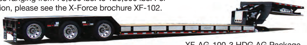
XF-AG-100-3 HDG AG Package 41046NTU

Payload capacities ranging from 70,000 lbs. to 120,000 lbs. For detailed information, please see the X-Force brochure XF-102.