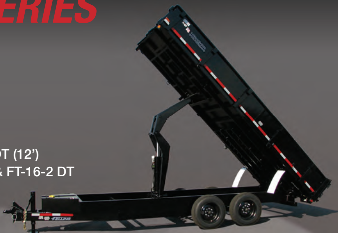
FT-16-2 DT DO 41044LAE