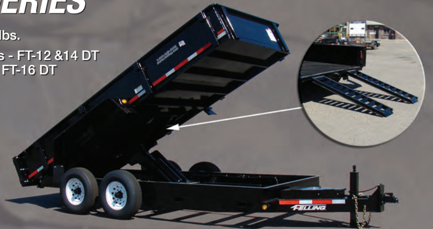
FT-14 DT HD - standard slide-out ramps store under deck 37668LAE