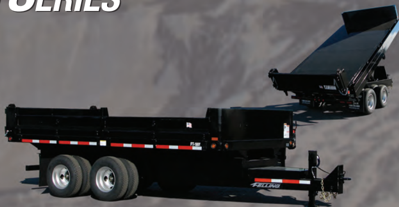
FT-18-2 DT DO Contractor Body standard fold down sides 31437