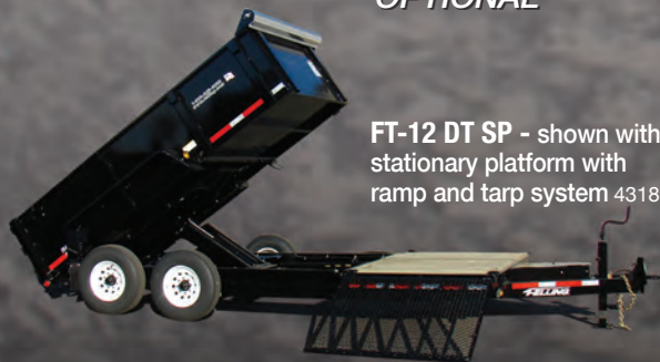
FT-12 DT SP - shown with stationary platform with ramp and tarp system 43188LAE

The Stationary Platform Option can be selected on any of Felling's Hydraulic Dump Model Lines.