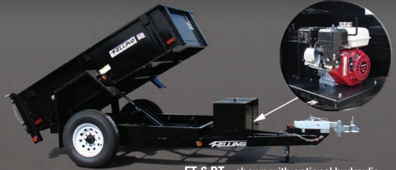
FT-6 DT - shown with optional hydraulic surge brakes & gas engine (in lieu of electric/hydraulic pump) 39504