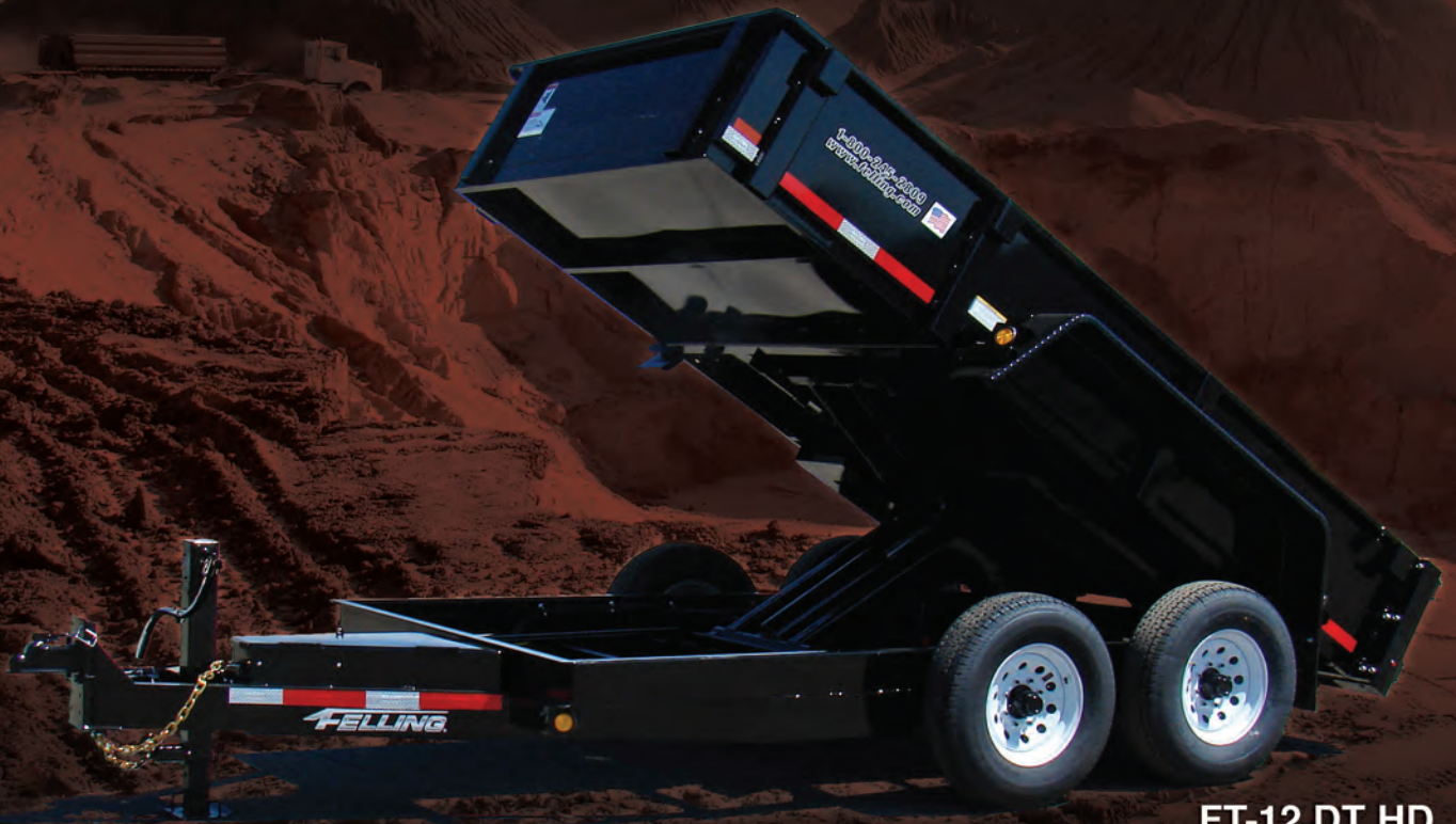
FT-12 DT HD 47264LAE

Trailers Shown Below: FT-6 DT 32174, FT-14 DT HD 378668LAE, FT-16-2 DT 60130BOO