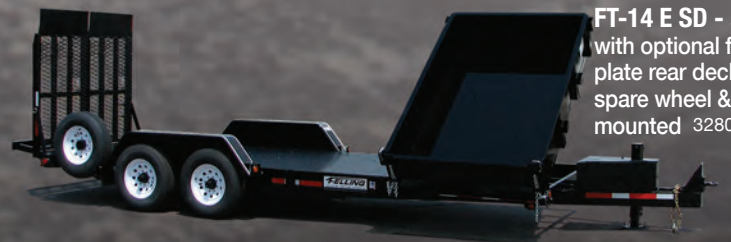
FT-14 E SD - shown with optional floor plate rear deck, spare wheel & tire mounted 32800