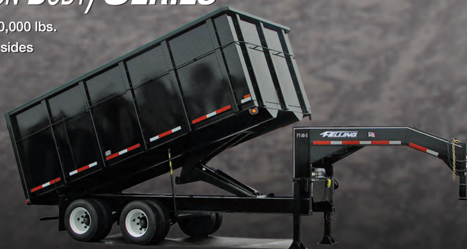
FT-30-2 DT DO Construction Body - shown with optional gooseneck coupler & tie rail around dump box 31833