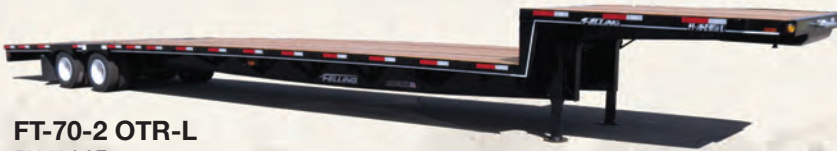
FT-70-2 OTR-L 56241-LAE