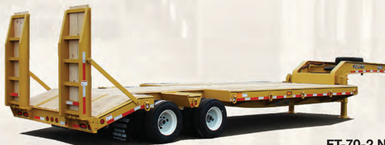
FT-70-2 NN-L (Options: Yellow Paint, Wood Inlaid Beavertail and Ramps) 32322-BOO