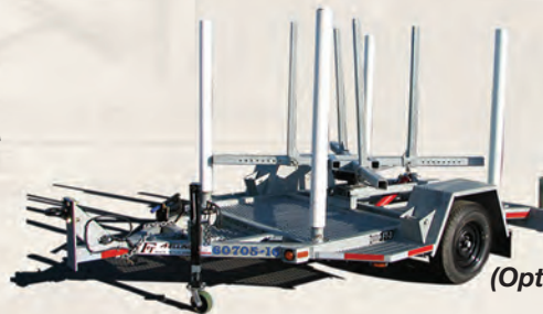
FT-3 C Coil (Option: Galvanized) 63329-NTU