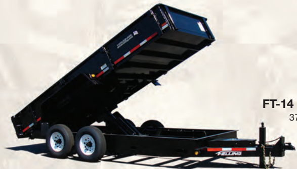
FT-14 DT HD 37668-LAE