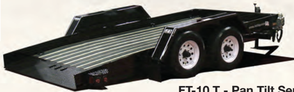
FT-10 T - Pan Tilt Series (Option: Blackwood Decking) 82785-EDS