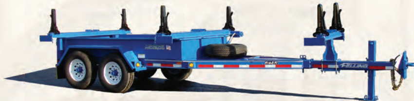
FT-14-2 PT-C 41775-BOO (Option: Cosmic Blue Paint, Front Bolster, Spare Wheel & Tire)