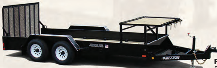
FT-10 CL 54887-LAE

Some models may be shown with optional equipment.