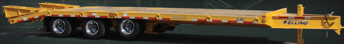
FT-50-3 LP (Low Profile) 53739-LAE