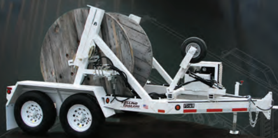
FT-14-2 R 34549