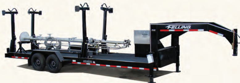
FT-16 I Gooseneck - Flare Trailer 47804-LAE