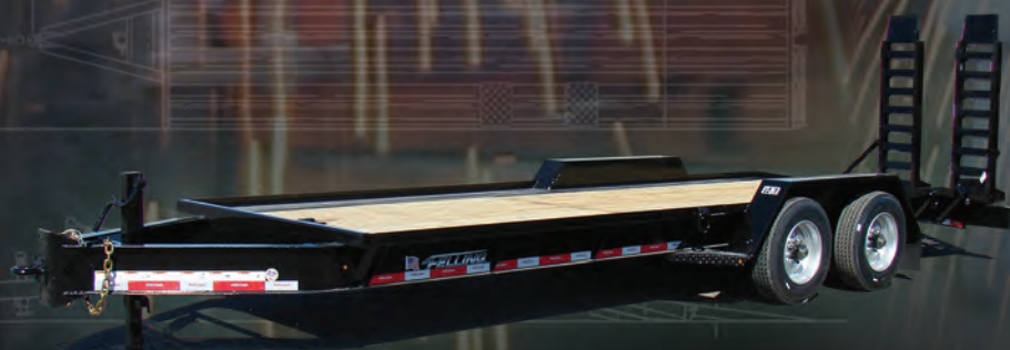
FT-24 I DRILL PKG. 84017-PKJ