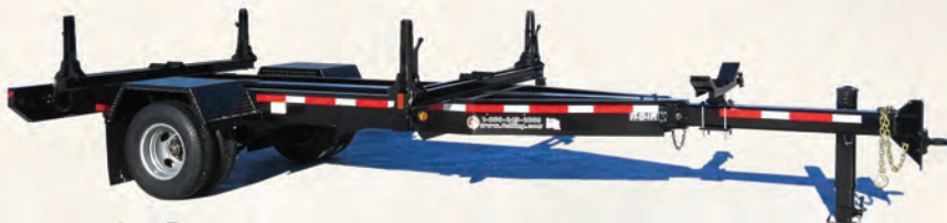
FT-12-1 PT 52154-LAE