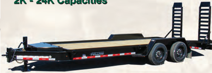
FT-16 I - I Series

(Option: Large Toolbox & Dovetail) 84018-PKJ