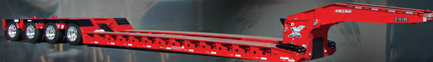
XF-110-3 HDG WITH XF-FLIP 20-1 72501-JDM

When It Comes To Your Equipment Hauling Needs - Talk To The Trailer Experts.