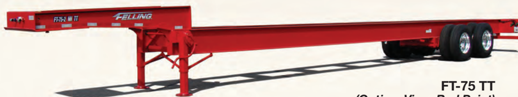
FT-75 TT (Option: Viper Red Paint) 38350