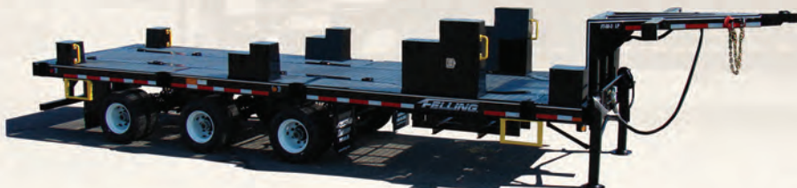
FT-50-3 LP GN (Low Profile) 39151