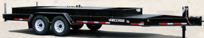
FT-14 GEN (Option: Fuel Tank) 33067