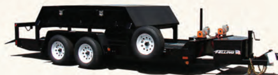
FT-10 T Scale Trailer (Pan Tilt) 35851