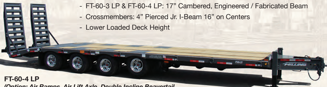
FT-60-4 LP (Option: Air Ramps, Air Lift Axle, Double Incline Beavertail, Hyd. Jacks, Aluminum Wheels & Paint) 74045-LAE