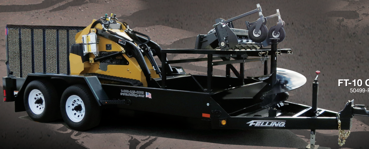
FT-10 CL 50499-PKJ