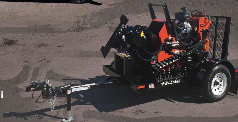
FT-3 Mini 90068-PKJ