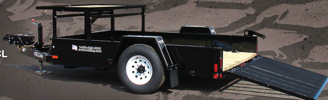
FT-6 CL 48532-LAE