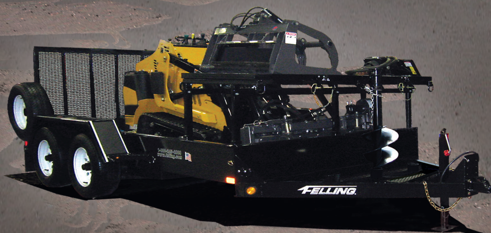
FT-10 CL 50499-PKJ Shown with optional spare wheel & tire mounted. Loaded with customer's equipment.