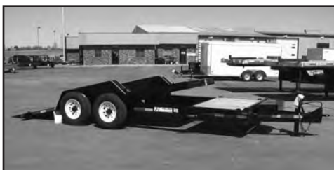
“IT-E” Series with Stationary Platform (SP)