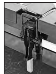
Tilt Bed Latch (A)