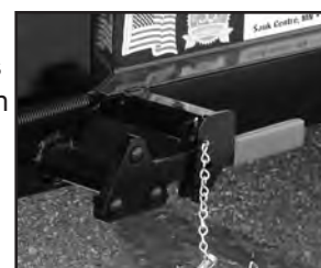
Tilt Bed Latch (B)