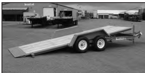
Standard “IT-I” Series