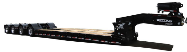
Shown with optional hyd. flip neck, & flip axle.